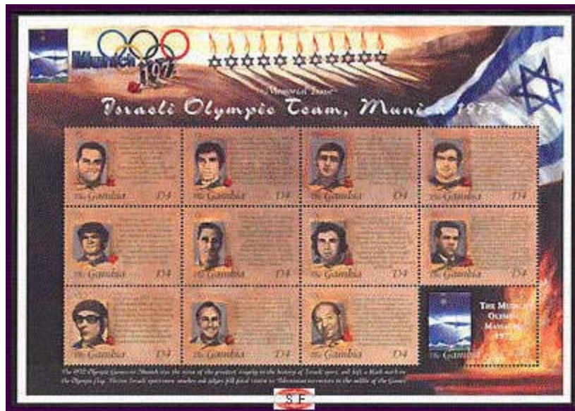
Gambia: Israeli Olympic Memorial Sheetlet